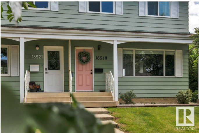
16519 115 St NW, Edmonton, AB

Main Floor Exterior Area 558.03 sq ft Interior Area 522.03 sq ft